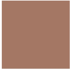
PANTONE® 17-1230 TCX Mocha Mousse

The garment/s in this category must be sewn by the member as part of a 4-H Clothing & Textiles Project* and modeled by the member at the Fashion Revue event.